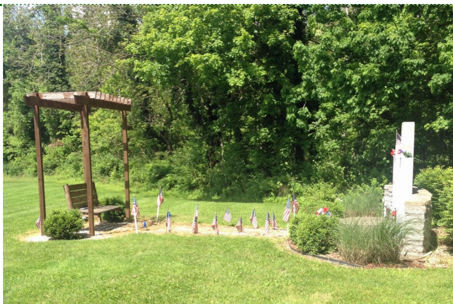
Memorial Day 2020 California WWII Memorial, Kellogg and Apple Hill